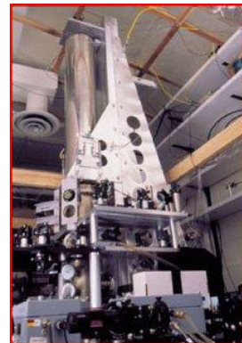
Figure 2 NIST Fountain-1 Accurate to 1 second in 20 million years.

Such super accurate time is critical for the Internet, law enforcement, golfers, television broadcasts, financial markets, computers, cell phones, and automobiles—each dependant on global positioning satellites. In astronomy, fractional-second errors could sabotage radio telescopes and the associated activities of space exploration and national defense. With atomic-time, the Air-Force operated GPS system can determine---to several feet in accuracy---the three-dimensional position of a receiver anywhere on or off earth. The receiver performs this trick by timing the arrival of signals from four GPS satellites, then doing a quick calculation to triangulate its position. 6 Stephen Dick, the United States Naval Observatory's historian, points out that each nanosecond---billionth of a second--- of error translates into a GPS error of one foot. A few nanoseconds of error, he points out, "may not seem like much, unless you are landing on an aircraft carrier, or targeting a missile."