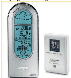
Figure 3 Talking Wireless Clock/Weather Station. Features: Crescendo alarm with snooze function, remote sensor, illuminated with electro-luminescent backlight, 3 levels of pressure, temperature and humidity, 12-24 hour weather forecast, language (French, German, Spanish) selectable auto-announcement of time, temperature, humidity, and weather forecast data, radio controlled time setting for 4 time zones. 3.33” x 1.5” x 8.10” Oregon Scientific 2004 (istcc)

Someone once said: “Clocks were like philosophers; you could never find two that agreed. Clearly, that was then. Now most new consumer clocks, whether for travel, wearing/carrying, or home use, can display or announce not the approximate time, but the precise time courtesy of radio-controlled “atomic” clocks. How civilian-atomic-time works is that a radio signal, known as the WWVB signal, transmits at 60 kHz to wherever the clock/watch-receiver is located. An atomic watch/clock has a built-in receiver that automatically tunes in to the WWVB signal that emanates from NIST in Boulder, Colorado. Atomic clocks/watches automatically adjust to Daylight Savings Time and leap-year, can forecast the weather, and set the calendar (Figure 3)!